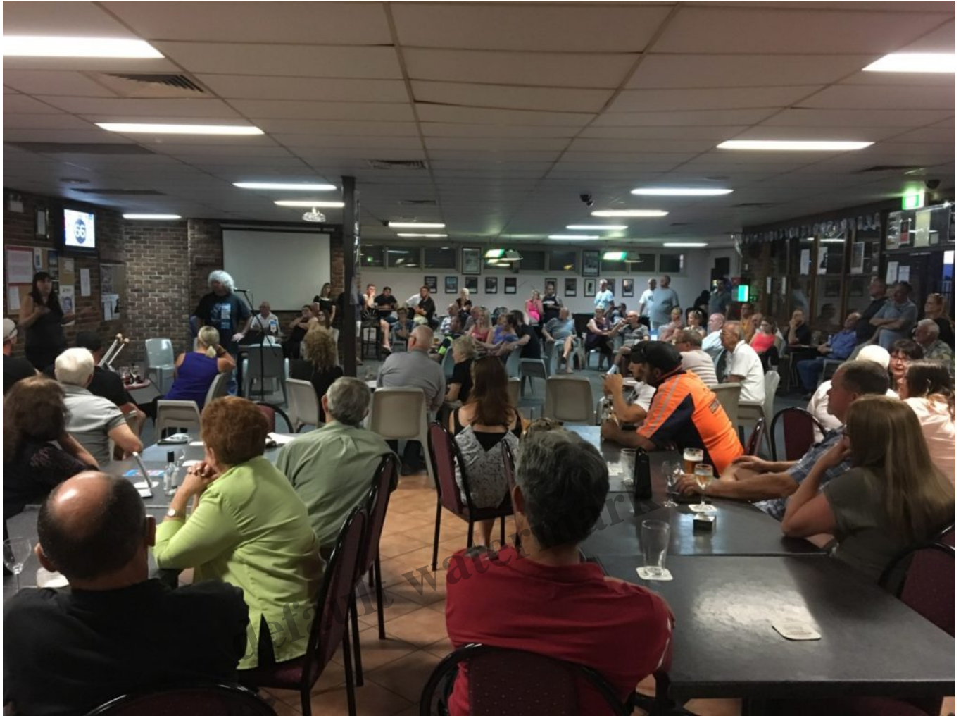
Objectors to the proposal meeting at McGraths Hill

I felt quite proud of the civility with which people spoke. These were ordinary people– tradies, retirees and professionals, voicing well-thought-through concerns about their perception of deficiencies in leadership and of process at Council. Neither race nor religion were mentioned, nor was any bigotry manifested. The most common sentiment expressed was “great idea, wrong spot”. Frankly, apart from a very small minority of noisy online ranters who were not even present at the meeting tonight , the stereotype of “objectors as racists” was completely disproven.