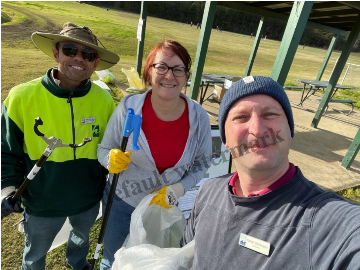
Helping to clean up Colbee Park at a May 2021 Council post-flood cleanup day, with Federal MP Susan Templeman (we were the only two volunteers who turned up!)

The masterplan documents are available at Council's website (meeting of 27 July 2021, item 140).