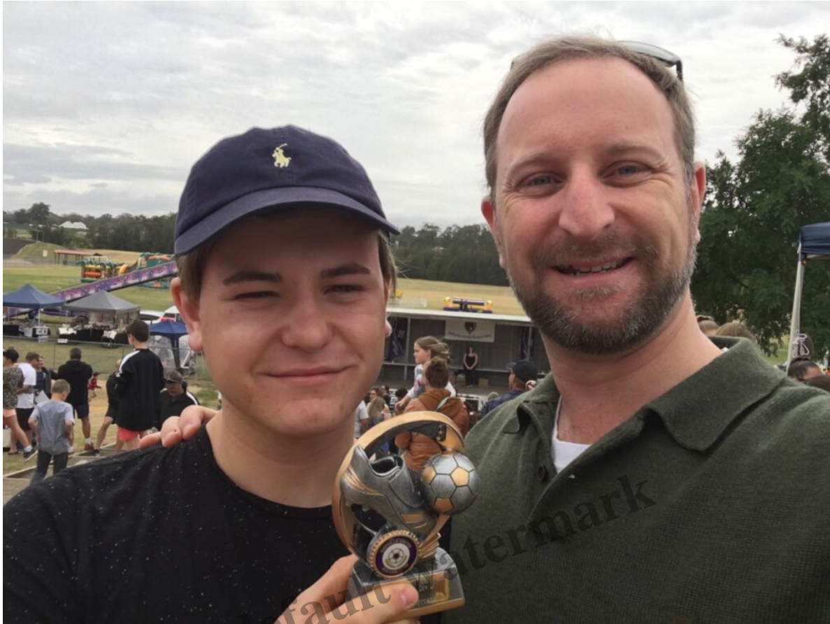
Colbee Park Soccer Dad!